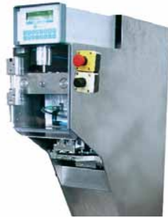
PLÜMATEX-BFM 007 | SFC

The PLÜMATEX-BFM 007- SFC Filling and Sealing Machine is designed as a table-top device to process the bags with SFC-System (Single-Function-Connector), which developed and patented by PLÜMAT. Bag as well as a Sealing Cap will be manually fed into the machine. All further operations are running automatically.